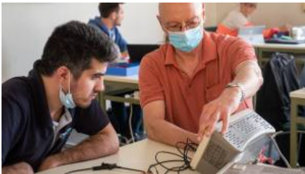
Fig. 1: ET1 Lab in SS2020