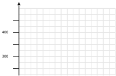
Fig. ##: Characteristic curve light bulb

Create the characteristic curve I = f(U) , s. figure ##