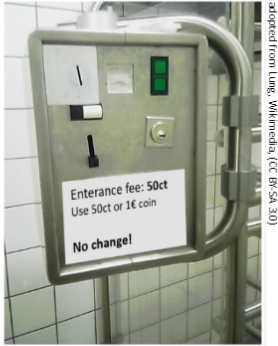
Fig. 11: Entrance Control for Toilets

The figure 12 the state transition diagram is drawn.