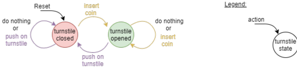
Fig. 12: State Transition Diagramm of the Entrance Control for Toilets

Out of this state transition diagram one can create a table-like representation, see figure 13.