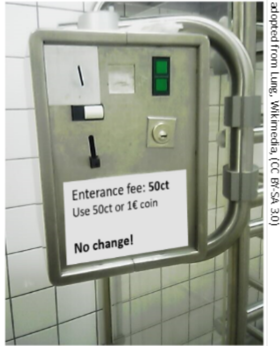
Fig. 11: Entrance Control for Toilets

The figure 12 the state transition diagram is drawn.