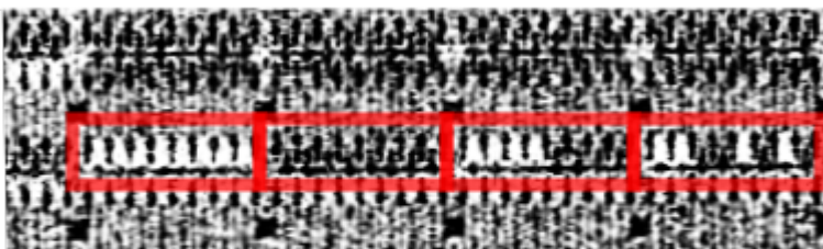
Fig. 12: example for stored data in an EEPROM