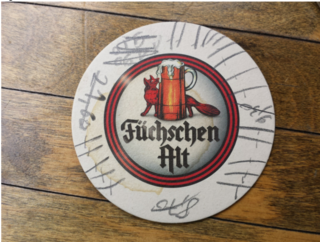
Fig. 1: number of drinks on a German Bierdeckel (coaster)

In ancient Rome these systems were deeper elaborated. There were different symbols which represent numbers of various sizes: