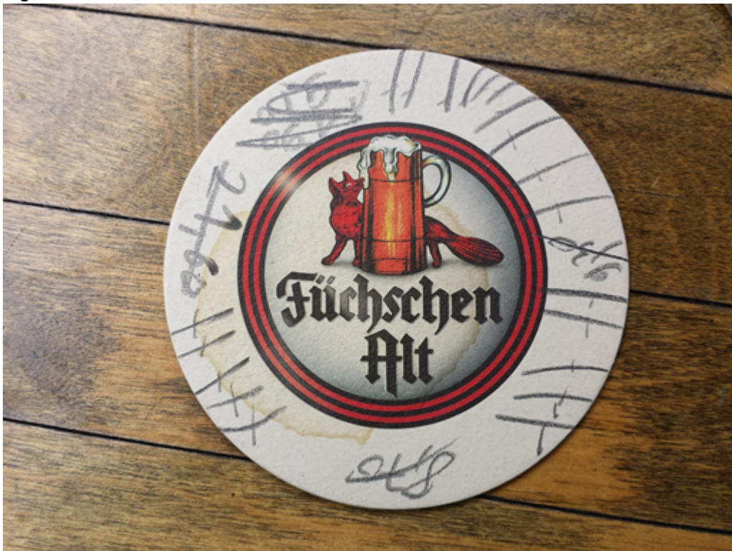
Fig. 1: number of drinks on a German Bierdeckel (coaster)

In ancient Rome these systems were deeper elaborated. There were different symbols which represent numbers of various sizes: