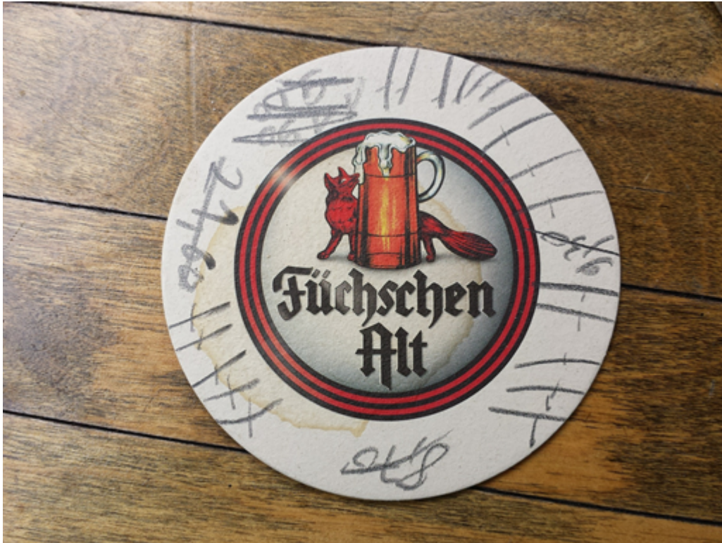
Fig. 1: number of drinks on a German Bierdeckel (coaster)

In ancient Rome these systems were deeper elaborated. There were different symbols which represent numbers of various sizes: