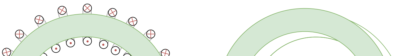
Fig. 18: Self-Induction of a toroidal Coil

The toroidal coil was analyzed in the last chapter(see magnetic Field Strength Part 1: Toroidal Coil ). Here, a rectangular intersection a assumed (see figure 18 ).