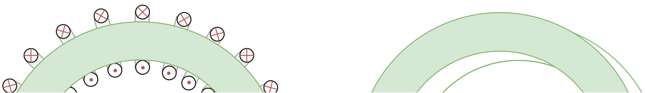
Fig. 18: Self-Induction of a toroidal Coil

The toroidal coil was analysed in the last chapter(see magnetic Field Strength Part 1: Toroidal Coil ). Here, a rectangular intersection a assumed (see figure 18 ).