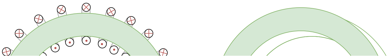
Fig. 18: Self-Induction of a toroidal Coil

The toroidal coil was analysed in the last chapter(see magnetic Field Strength Part 1: Toroidal Coil ). Here, a rectangular intersection a assumed (see figure 18 ).