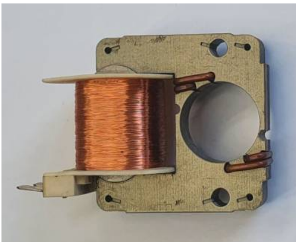
Fig. 25: Core of a shaded Pole Motor