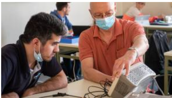
Fig. 1: ET1 Lab in SS2020