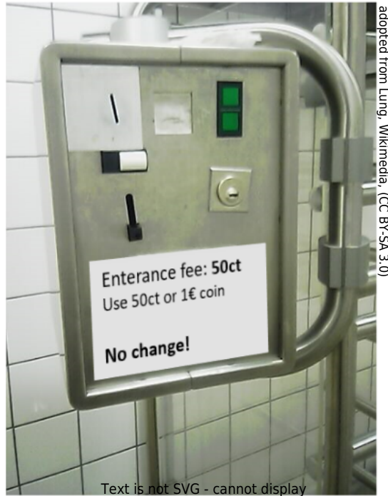
Fig. 11: Entrance Control for Toilets

The figure 12 the state transition diagram is drawn.